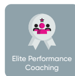
Elite Performance Coaching

Join our 6-month Innovation & Growth Program, hosted by Elite Performance Coaches (Ex-Agents), working with you to refocus, review and achieve your goals.