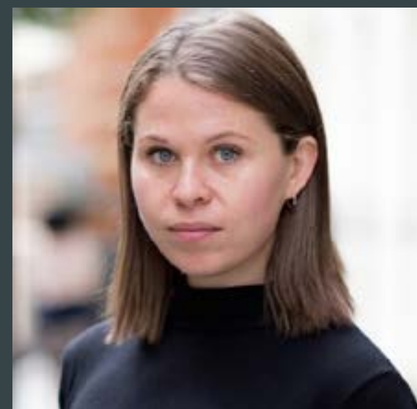
Ellen Content Creator